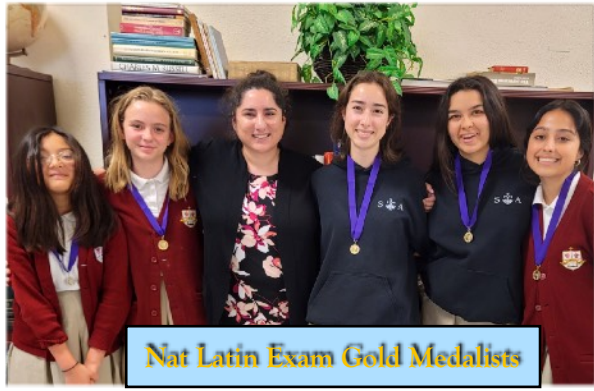
Nat Latin Exam Gold Medalists

Few things offer teachers more satisfaction and pride than knowing their student, after matriculating into college, is thriving academically and spiritually. Naturally, the same can be said for parents about their children. It's been a big confidence boost to our academy to see how well St. Therese graduates have been performing in the colleges of their choice. Not to mention the